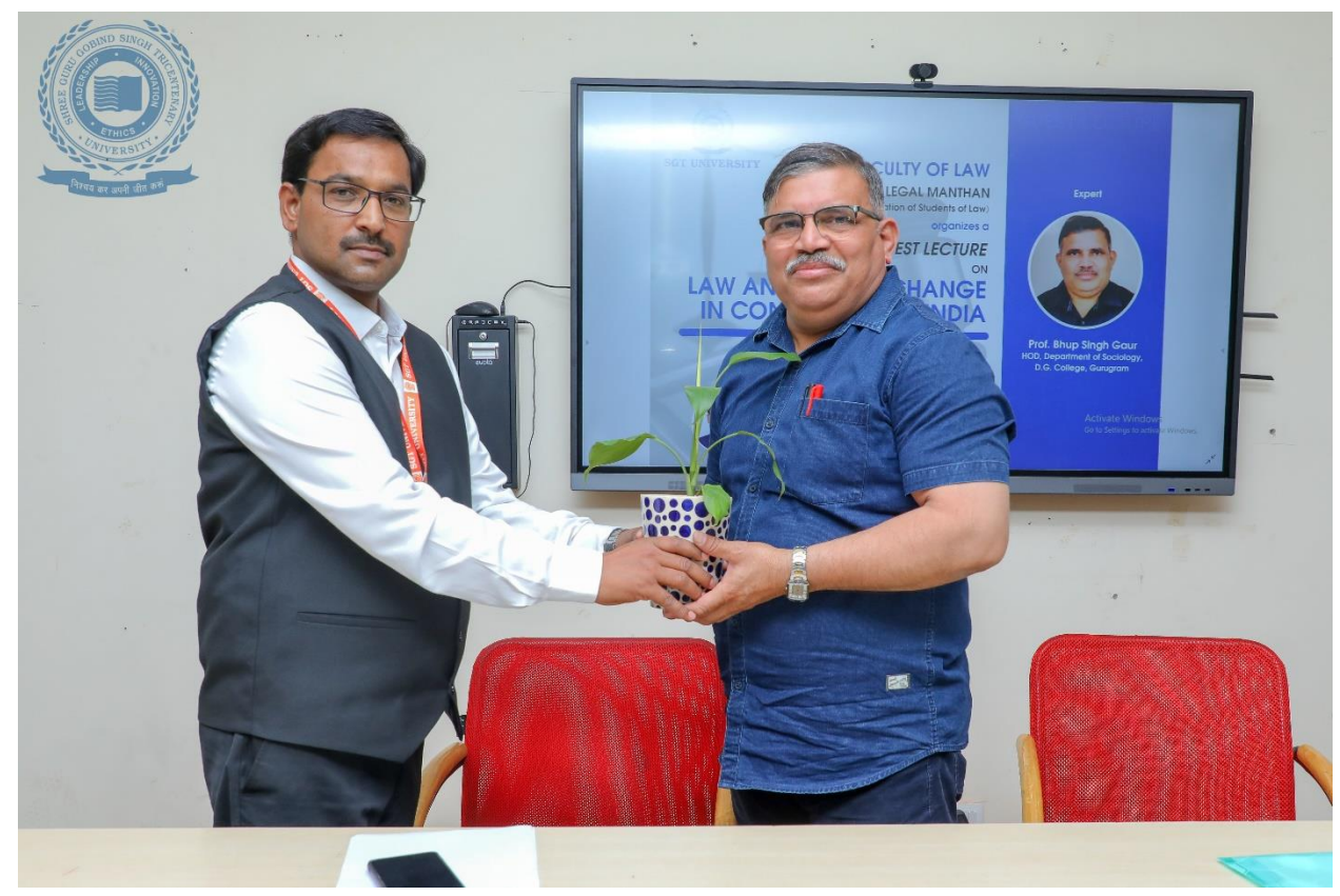
Figure: 02 The Dean felicitates the guest

Budhera, Gurugram-Badli Road, Gurugram (Haryana) – 122505 Ph. : 0124-2278183, 2278184, 2278185