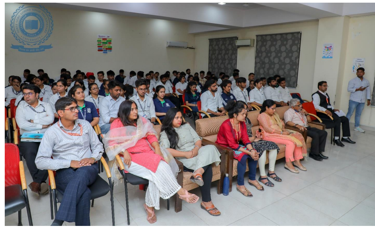
Figure: 04 A Panoramic view of audience

Budhera, Gurugram-Badli Road, Gurugram (Haryana) – 122505 Ph. : 0124-2278183, 2278184, 2278185