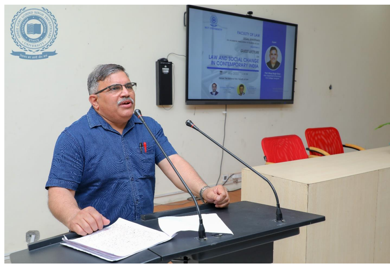
Figure:03 The speaker addresses the gathering

SHREE GURU GOBIND SINGH TRICENTENARY UNIVERSITY (UGC Approved) Gurugram, Delhi-NCR